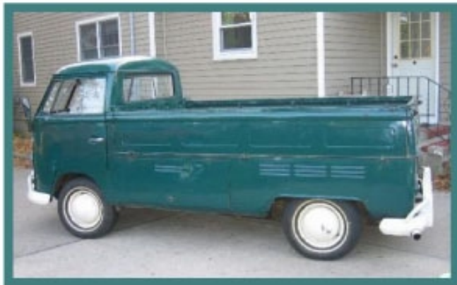
BRAD'S SPLIT CREW CAB

3rd Generation Transporter introduced in 1979 featuring redesigned body style