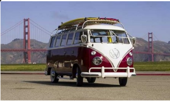
VOLKSWAGEN OF AMERICA, INC