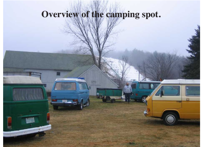
Overview of the camping spot.