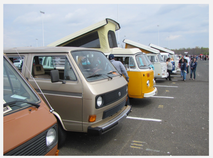
Only a few Vanagons were present