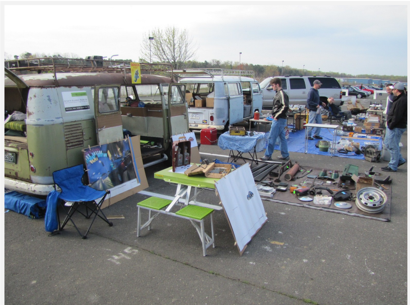
Swap Meet action