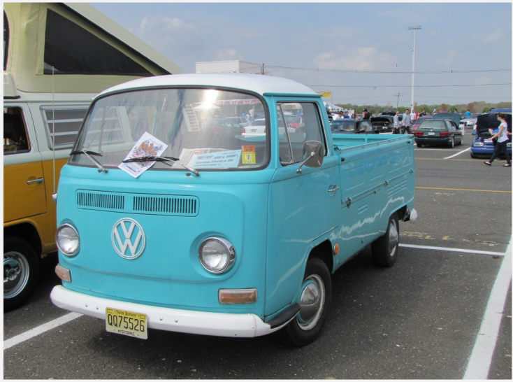
Nice Bay Window Single Cab