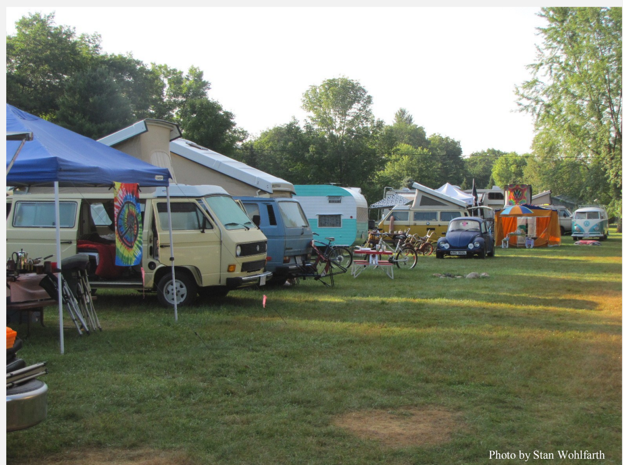
WEST RIVER WESTIES, 2011 (SEE PAGE 4-5)