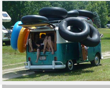
Loaded up for a river ride!

I t was an awesome weekend with a record number of VW Transporters, drivers, passengers, family members, visitors, dogs, cats and birds. They enjoyed 3 or 4 days of the most beautiful July weather coupled with a visit from the Full Buck Moon that started early on Friday morning and was visible the entire weekend.