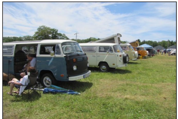
Buses in the field.