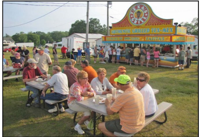
Enjoying a meal.