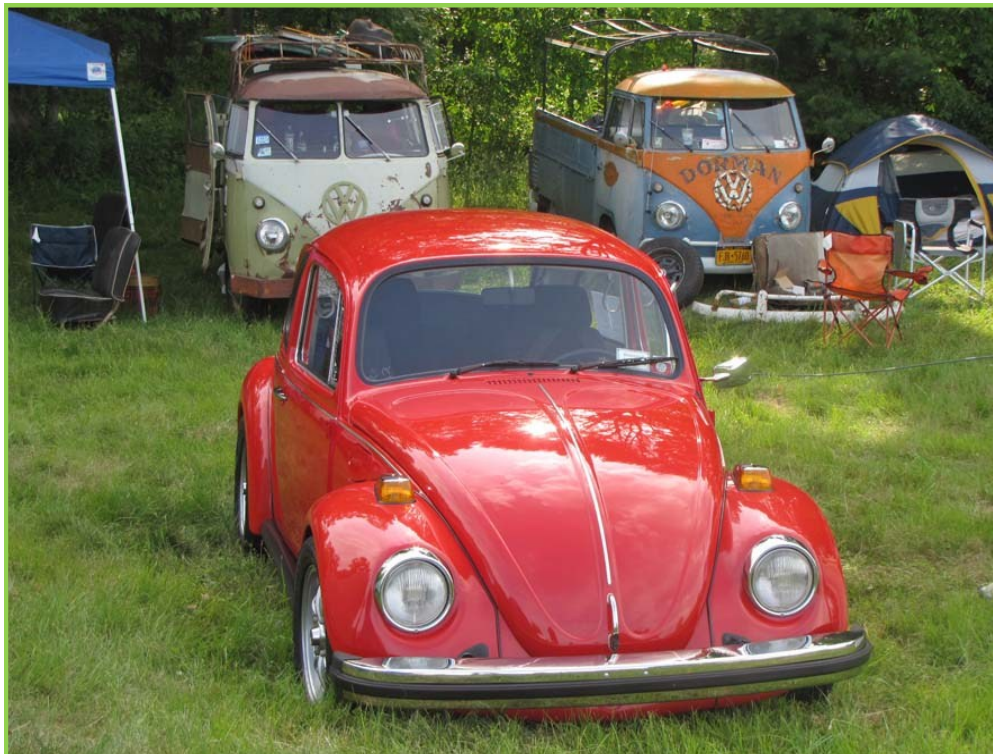
Glenn Ring's beautiful original-owner Beetle