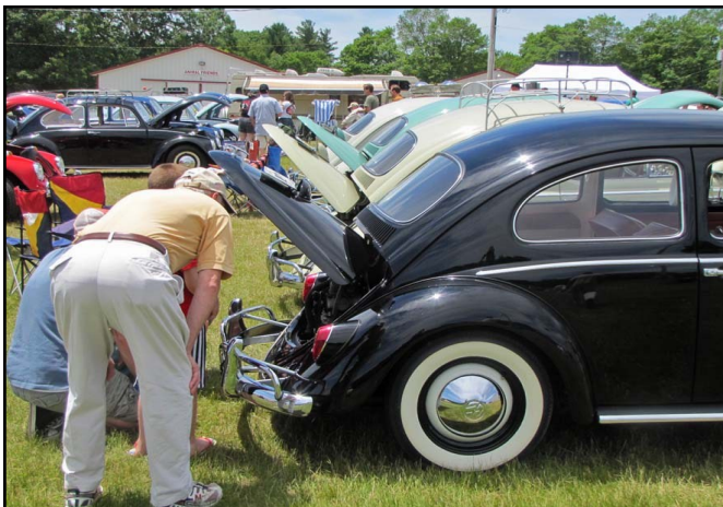
Checking out an engine.