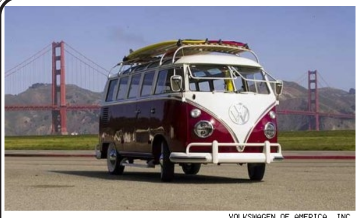
VOLKSWAGEN OF AMERICA, INC